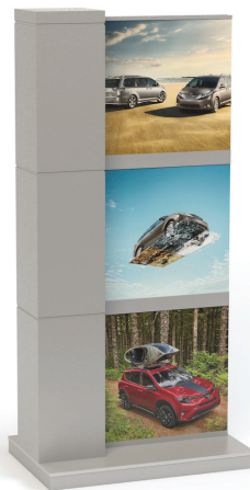
B2.2L Graphic Display Freestanding

TO ORDER Toyota Graphic Acrylic Holders and Fixtures PLEASE CONTACT: