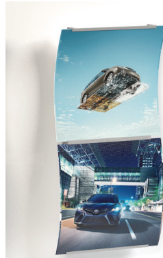
B1.1D Graphic Display Wall-mounted