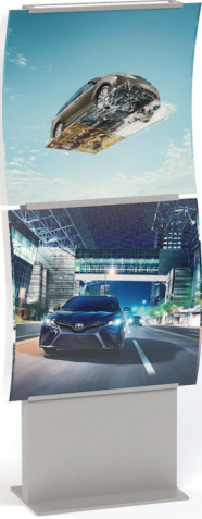
B1.1 Graphic Display Freestanding