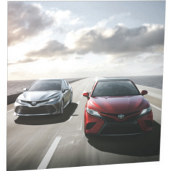
B4.2 Acrylic Graphic Holder