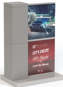
B2.2S Graphic Display Freestanding